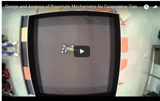
Fig. 1. Video showing groups of 3, 4, 5 and 6 real e-puck robots transporting a cuboid object placed in the centre of bounded square arena (220 cm side length). The maximum time the trail can last is 180 s and consider successful if the group manages to transport the object up to 1 m distance from it's starting position. The object's position is tracked using Vicon tracking system. To play the video, click on the above image or use the following URL https://www.youtube.com/embed/B1bdGegkgXY